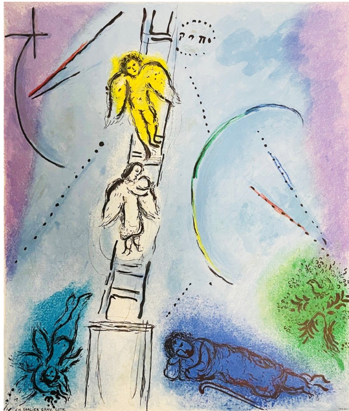
"The Angels" after the work of the artist, Marc Chagall