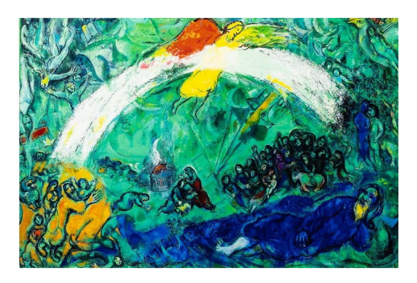
11:00am Traditional Worship Service 1st Sunday in Lent February 18, 2024

Discovering and displaying Christ in here and out there