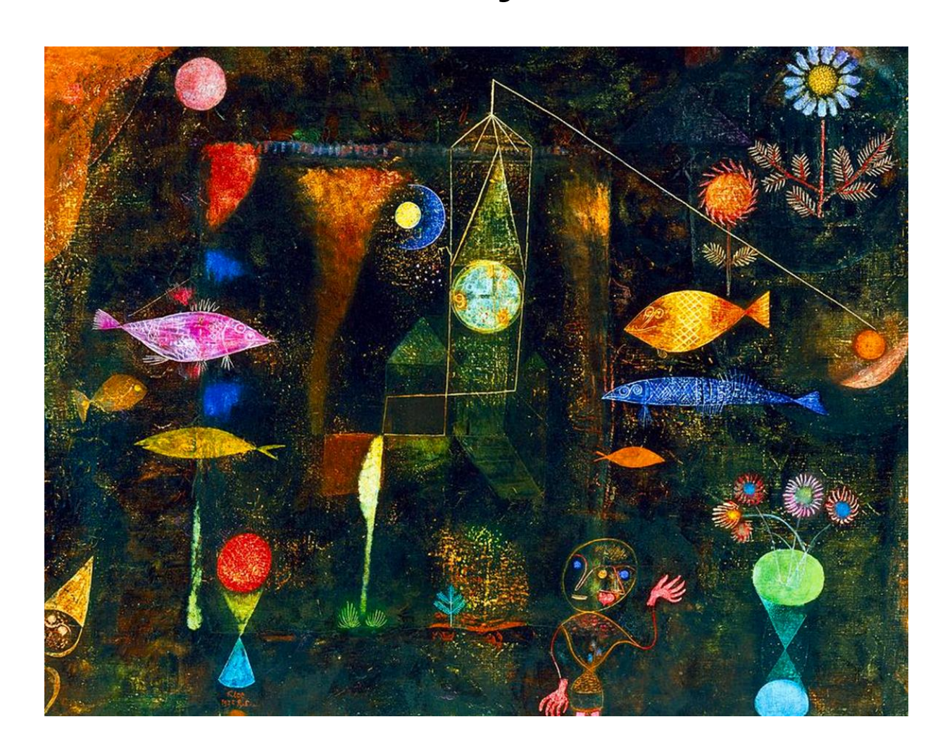
11:00am Traditional Worship Service January 21, 2024

Discovering and displaying Christ in here and out there