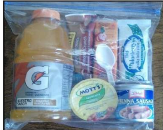
Complete Food Kit

Bulk contributions of these items are also welcome.