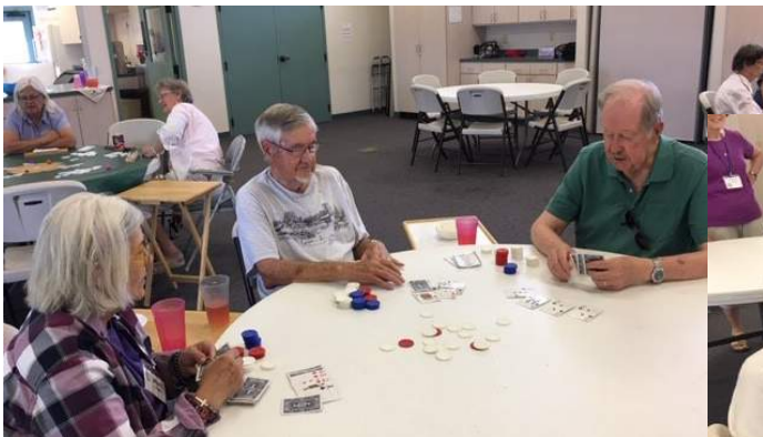
Winning hands at Desert Sages