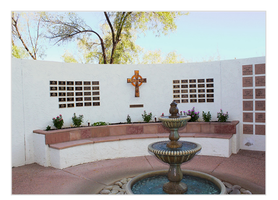
Memorial Wall and Fountain

Death brings loss, sorrow, and grief to all. In the face of death, Christians affirm with tears and joy the hope of the gospel: the resurrection—life after death. The resurrection is a central doctrine of the Christian faith and shapes Christians' attitudes and responses to the event of death. As Christians, we do not have to bear bereavement alone. We are uplifted by the Holy Spirit and sustained by our community of faith. The church offers a ministry of love and hope to all who grieve.