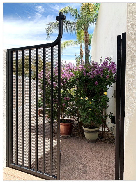
Immanuel Memorial Garden